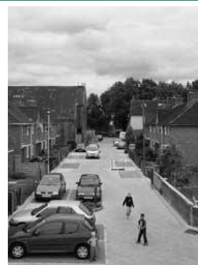
A homezone in Bristol, before and after it was created