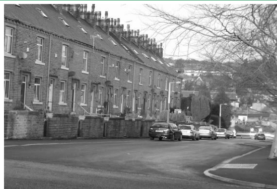
New-Look Dockfield Terrace Homezone